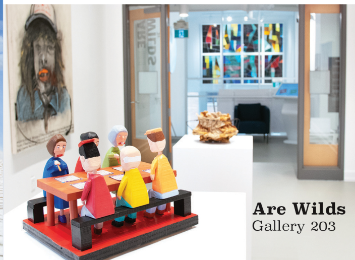
Are Wilds Gallery 203

Barrier-free access is available at all entrances and the elevator is centrally located.